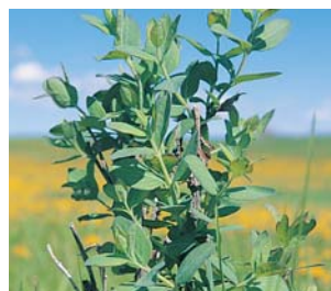
Buckbrush (western snowberry)

The combination of ClearView plus Vantage Plus MAX II will provide control of the weeds listed for control with ClearView, plus all the annual grasses, broadleaf and perennial weeds on the Vantage Plus MAX II label. This labeled tank mix provides effective, season-long bareground control of grassy and broadleaf weeds. On its own, ClearView provides season-long control of germinating and emerging seedlings of hard-to-control broadleaf weeds.