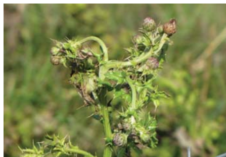
Canada thistle – two weeks after ClearView application

Most susceptible species will be controlled within 4 to 8 weeks following application.